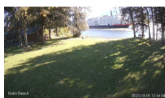
Live Bob's Beach Cam