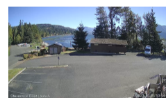
Cascade Boat Launch