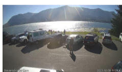
Live Kite Cam