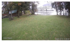
Live Bob's Beach Cam