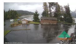
Cascade Boat Launch