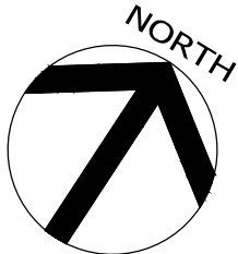
EXHIBIT "B" ADJUSTED TAX PARCEL 02070111-6900 LOCATED IN THE NE 1/4 OF THE NE 1/4 OF SECTION 1, T2N, R7 E, W.M. SKAMANIA COUNTY, WASHINGTON